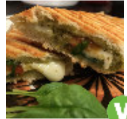
£5.95 Mozzarella Panino