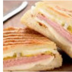
£5.95 Ham & Cheese Panino