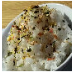
£3.50 Furikake Gohan