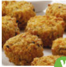
£3.95 Curry Bites

Choose: Humous, Salsa, Tzatziki dip with tortilla chips. Guacamole £3.75