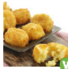
£3.95 Mach Cheese Bites

Rice, onion, sultanas & sweet potato in a parsley breadcrumb (6 pieces)