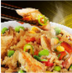
£7.95 Chicken Teppanyaki

Grilled chicken pieces with rice & choice vegetables