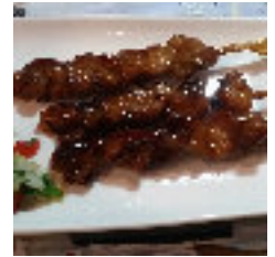
£4.95 Yakitori Chicken

Breadcrumb-coated balls of macaroni pasta & 3 cheeses (5 pieces)